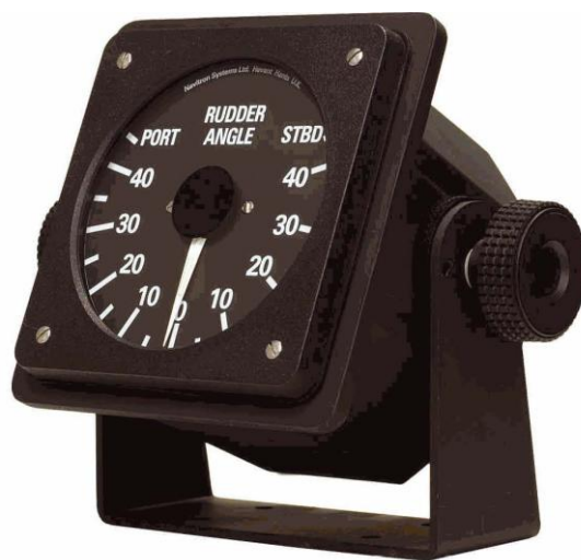
Model NT920RAI (PM) Pod Mount Assembly Dims 125mm x 125mm x 85mm (depth)

Simple 'on board' calibration and inbuilt facilities for fixed or variable intensity red scale illumination are also standard features.