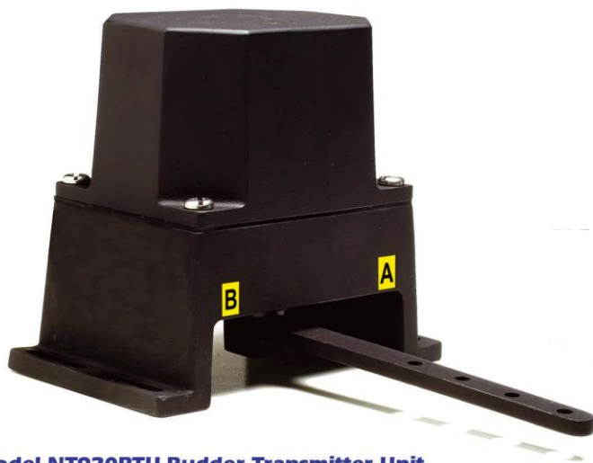
Model NT920RTU Rudder Transmitter Unit Dims 100mm x 165mm x 145mm (height)

Where Indicators are to be bracket mounted or externally located, a rugged pod assembly is available as an option which must be exercised to provide the necessary mounting assembly and weather proofing facilities