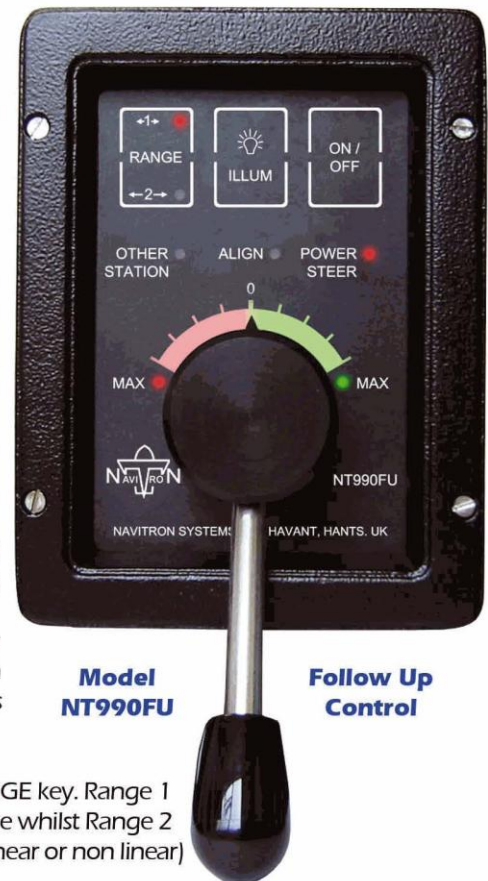
Model NT990FU Follow Up Control

When the NT990FU is engaged (ON) and the vessel is power steered to a new heading by this means, the autopilot course setter card 'tracks' ships head. On attainment of the new heading required, the NT990FU key can be set to OFF at which time the course setter card automatically 'locks' and the autopilot immediately resumes control to maintain the vessel on the new (current) heading.